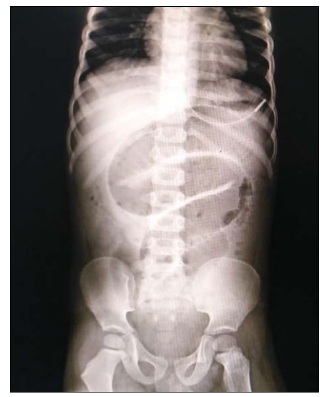
Figure 2: Plain X-ray showing adhesive obstruction necessitating laparotomy.

A 2 year male child presented with abdominal distention, fever and non passage of stool for 3 days.