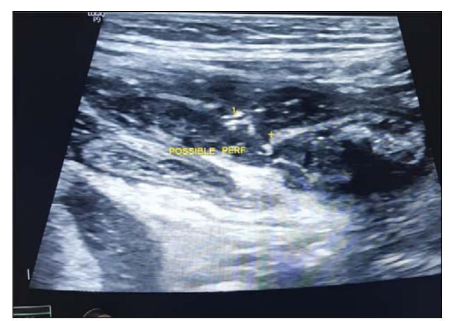
Figure 4: USG showing appendicular perforation with free fluid